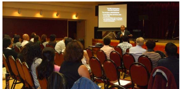
North York Christian Fellowship (North York, ON)

The same weekend, I spoke at the North York International Fellowship in Ontario. I challenged church members to understand their responsibility to fight abortion. Many came up to me and told me that they didn’t realize how horrible abortion was. One church member told me she works with immigrant women and wants me speak to her group when I return to Toronto.