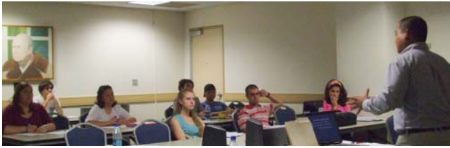
George Washington University (Washington, D.C.)

campus groups and two community groups. Most of the people I spoke to hadn't heard about our work before. One student from George Washington University wrote in her survey "I now know more ways to defend [the pro-life view] and I thus feel more confident in the position."