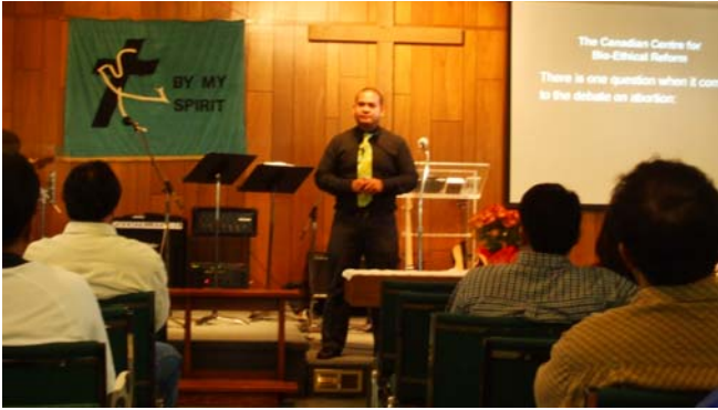
River of Life Church of the Nazarene (Winnipeg, MB)

campus groups and two community groups. Most of the people I spoke to hadn't heard about our work before. One student from George Washington University wrote in her survey "I now know more ways to defend [the pro-life view] and I thus feel more confident in the position."